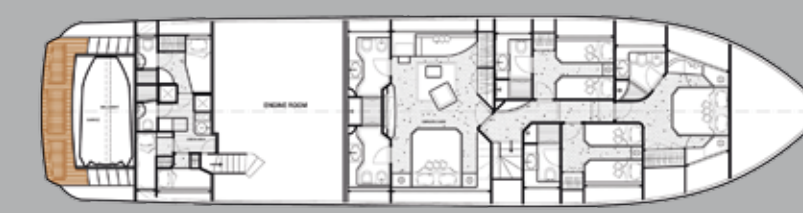
Lower Deck - proposal C

There may be items shown in these photographs and artist impressions that are not included in the standard inventory of the models shown. Any eventual print mistake cannot be considered as object of claim.