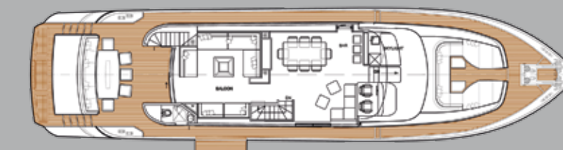
Main Deck-proposal A

Engineering: Dominator Engineering Division