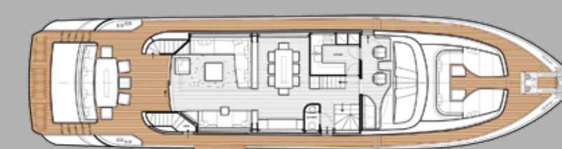
Main Deck - proposal C