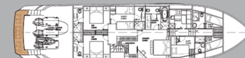
Lower Deck - proposal B