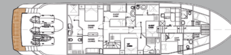
Lower Deck-proposal A