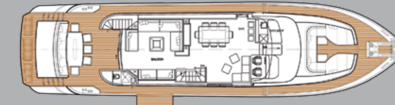
Main Deck - proposal B