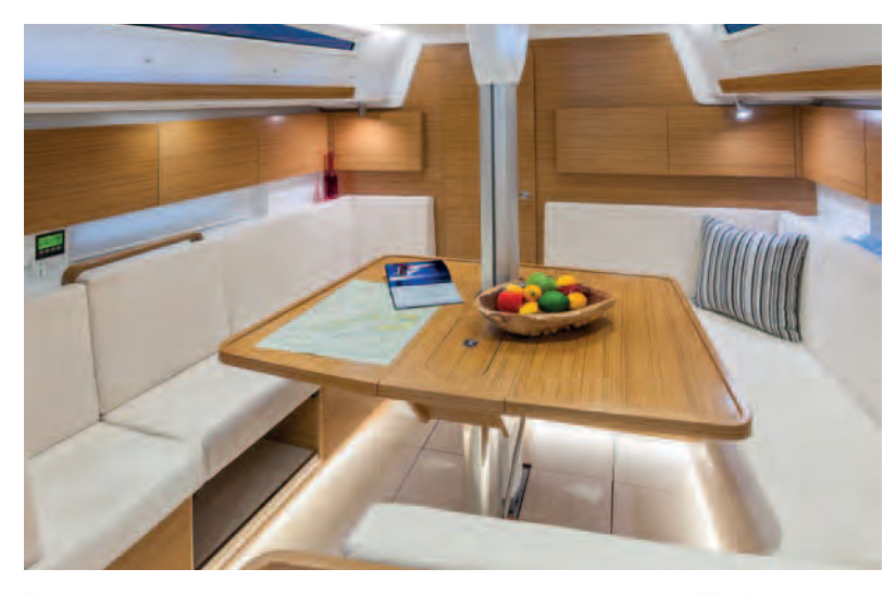
Bright and spacious saloon with optional ambient LED lights for a private atmosphere.