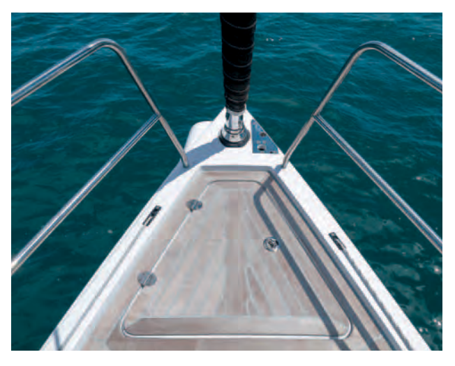
Removable anchor roller and through-deck furler.