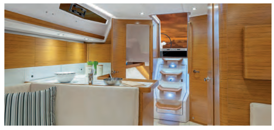
Elan E5 features a lower companionway for easier access down below, LED overhead lighting and ergonomically positioned handrails.

Fully equipped L-shaped galley will satisfy even the most demanding chefs.