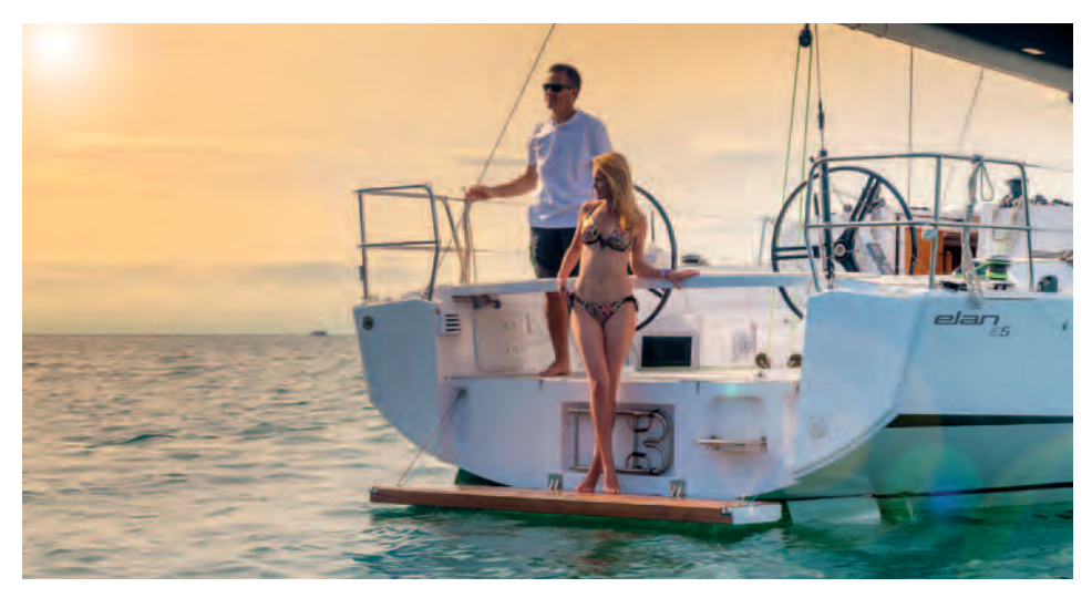
Folding platform at sea level for enjoyable swmming.

Foot supports for safer steering when heeled.