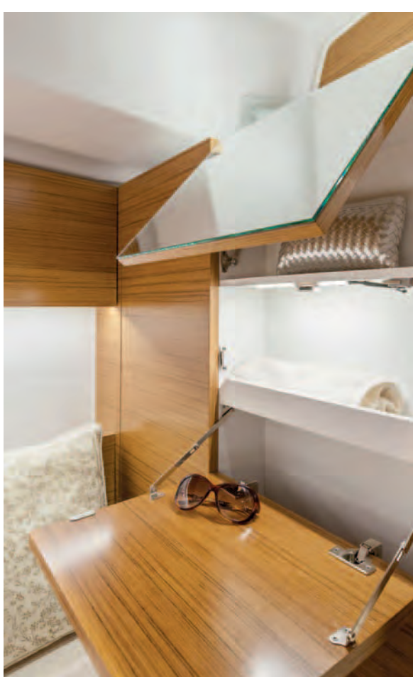
Bright and comfortable forward cabin featuring a double berth and a vanity closet for the ladies, or the option of forward head with a flip-up sink.