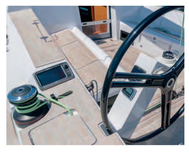
Deck gear positioning with short handed sailing in Electric halyard winch option for easier hoisting. mind.