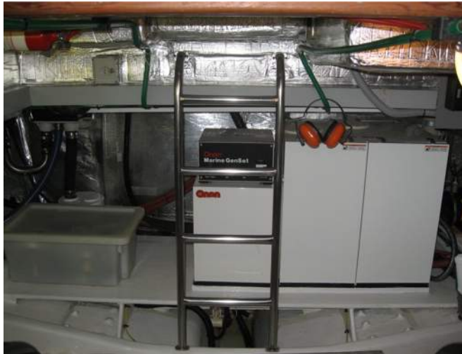
Phoenix IV's Engine room