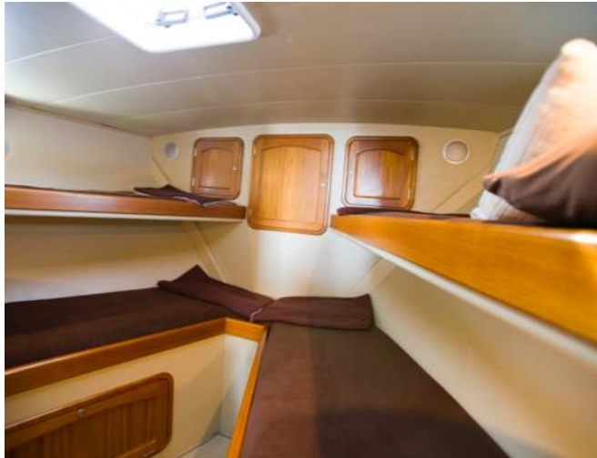
Phoenix IV's Guest Cabin forward