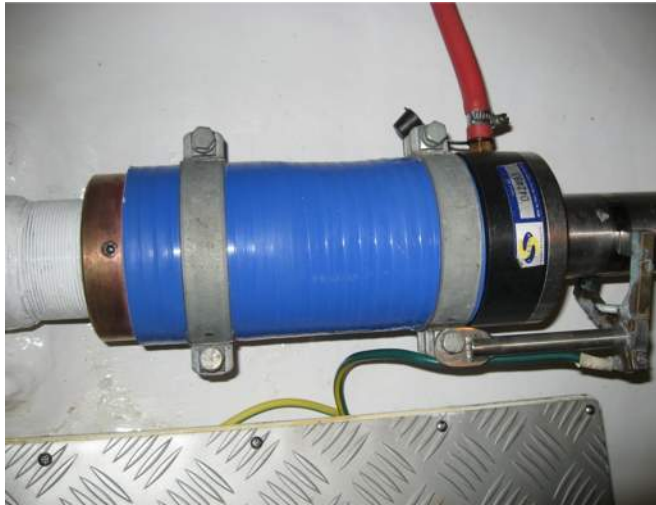
Phoenix IV's Engine room