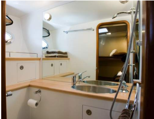
Phoenix IV's Ensuite