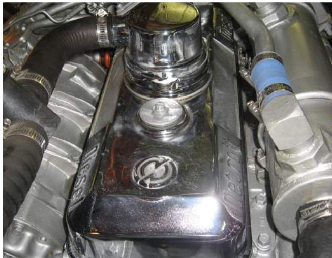
Phoenix IV's Engine room