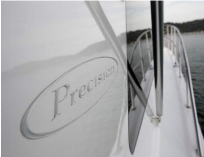
Phoenix IV's Exterior