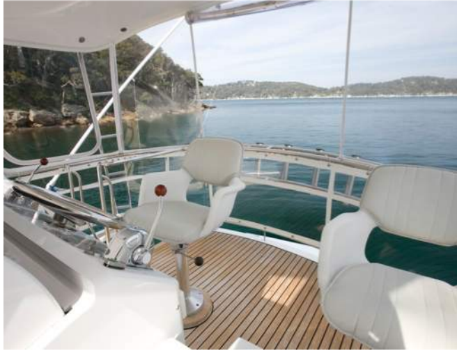
Phoenix IV's Helm