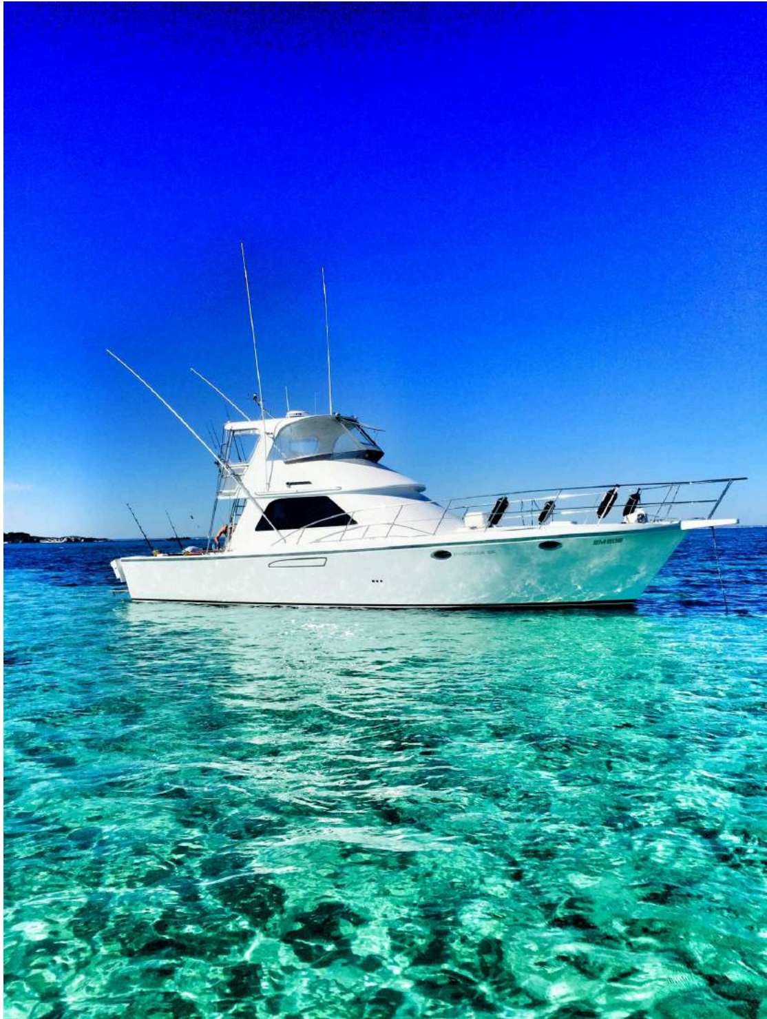
Phoenix IV - Precision 50

All speeds, capacities, consumption, etc. are approximate or estimated; measurements can also be approximate.