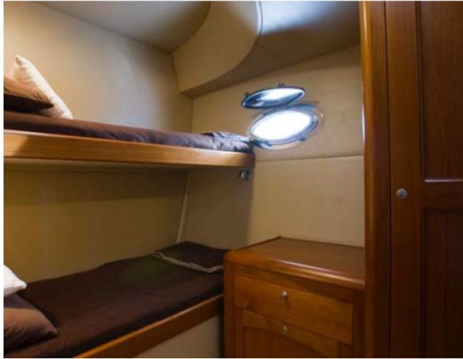
Phoenix IV's Master Cabin