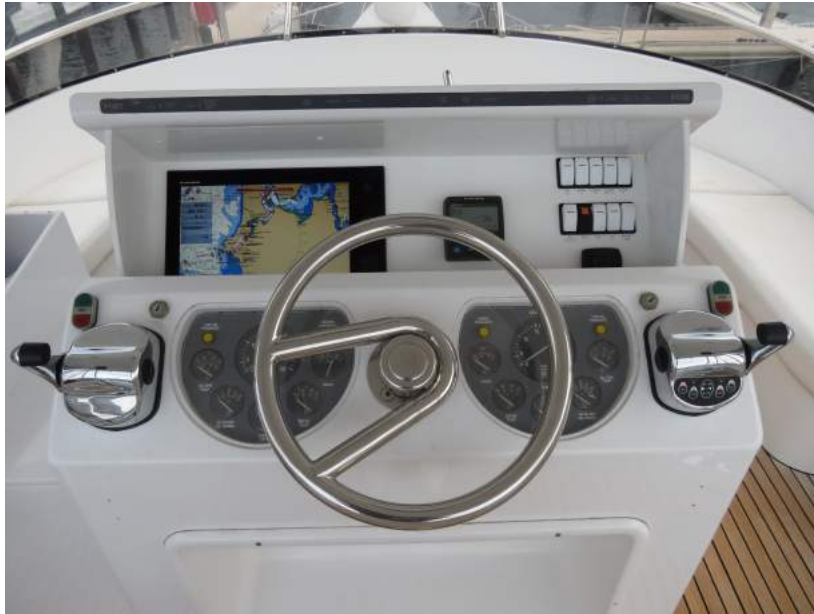
Phoenix IV's Helm