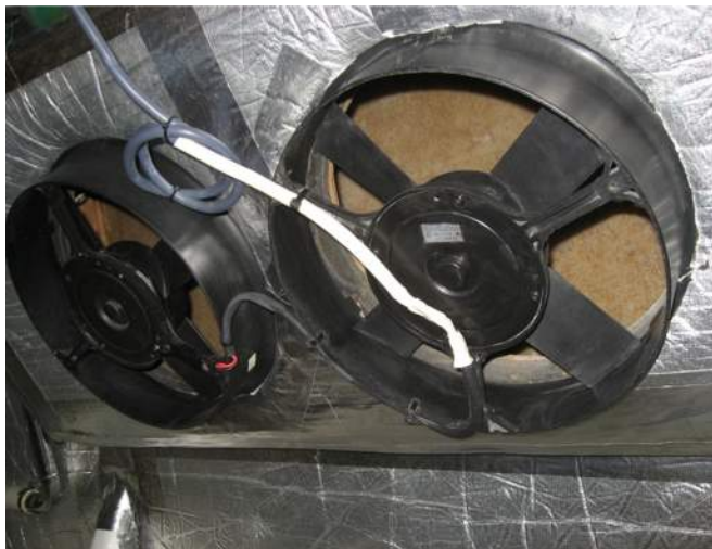
Phoenix IV's Engine room