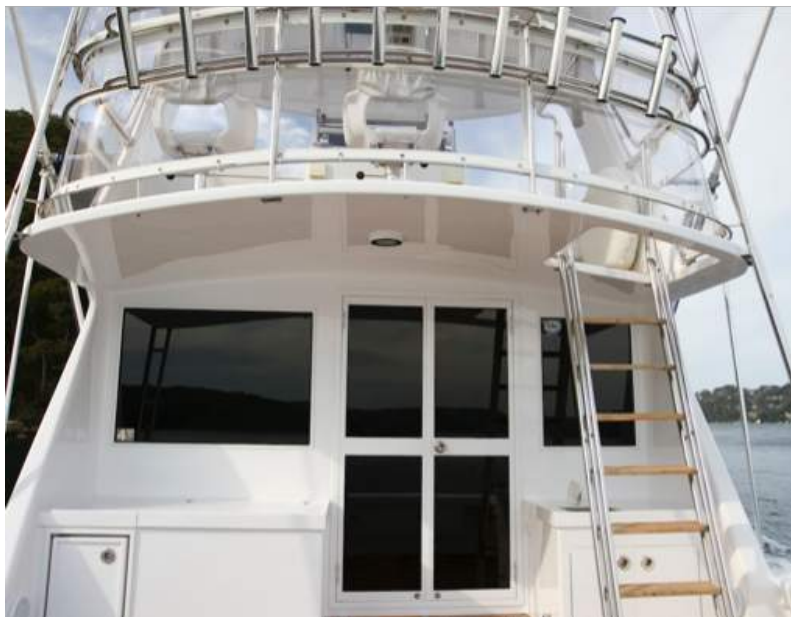
Phoenix IV's Exterior