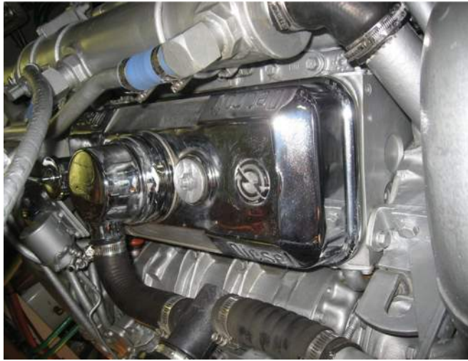
Phoenix IV's Engine room