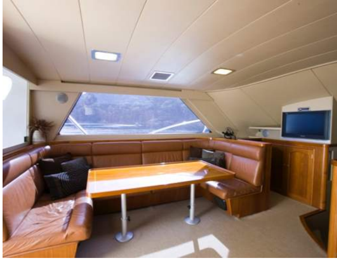
Phoenix IV's Saloon