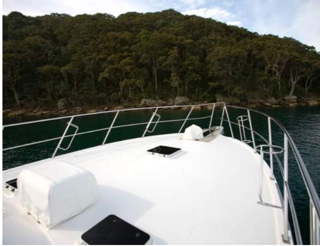
Phoenix IV's Foredeck