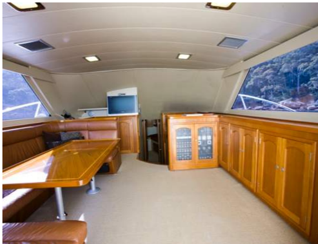
Phoenix IV's Saloon