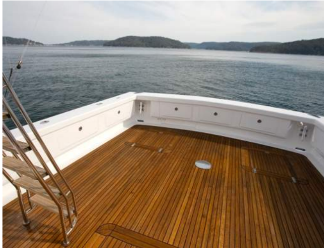
Phoenix IV's Cockpit

Huge range at displacement speeds - at a speed of 8 knots you have a range of 400 Nautical Miles in safety and comfort with 10% in reserve