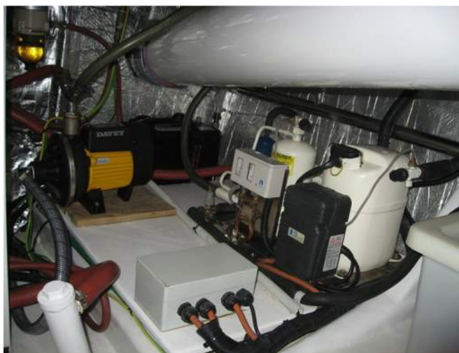
Phoenix IV's Engine room