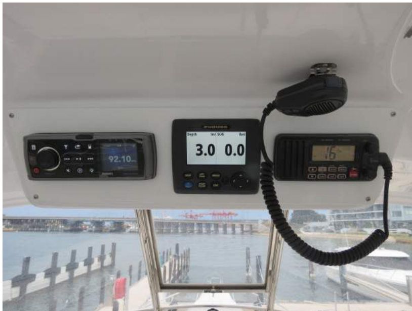
Phoenix IV's Helm