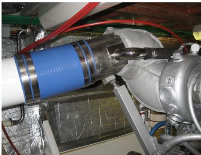
Phoenix IV's Engine room