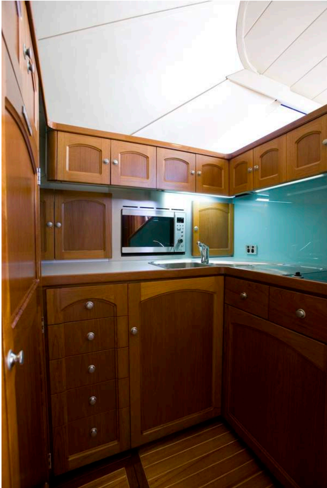
Phoenix IV's Galley