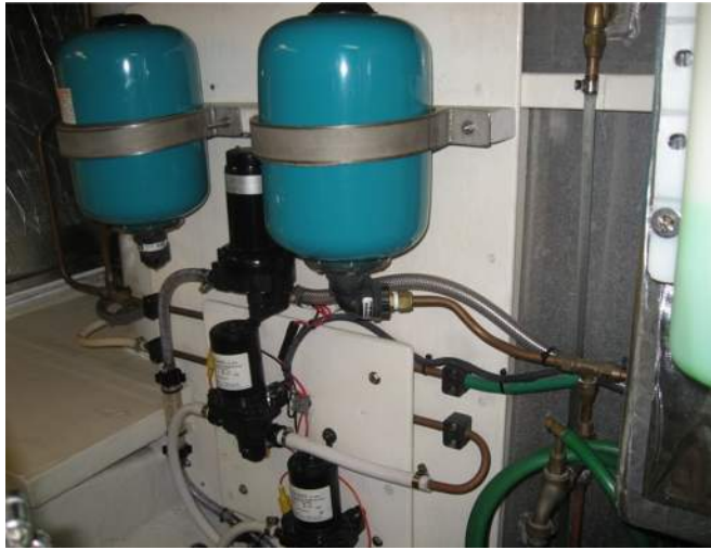
Phoenix IV's Engine room