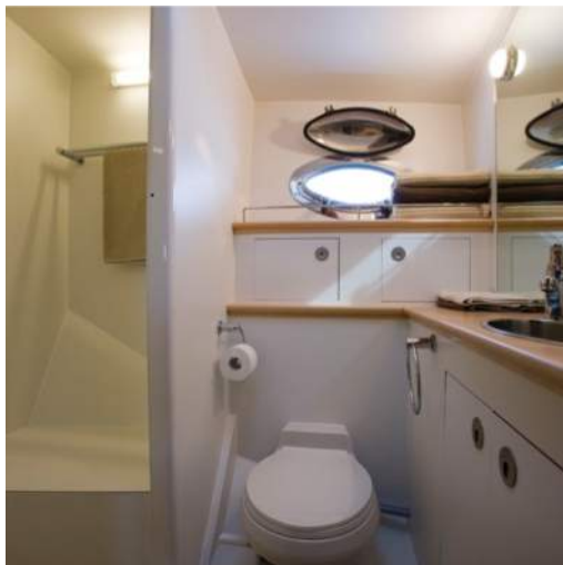
Phoenix IV's Day Head