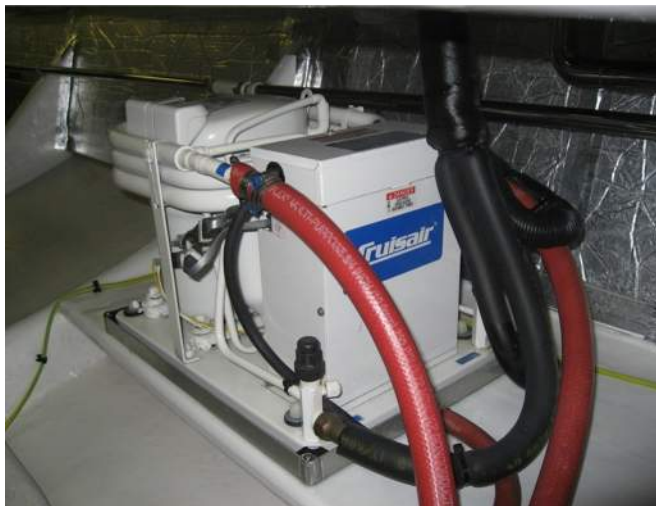
Phoenix IV's Engine room