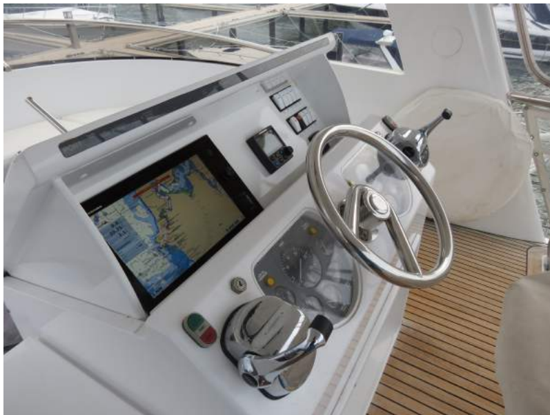
Phoenix IV's Flybridge