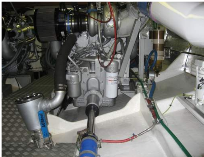
Phoenix IV's Engine room