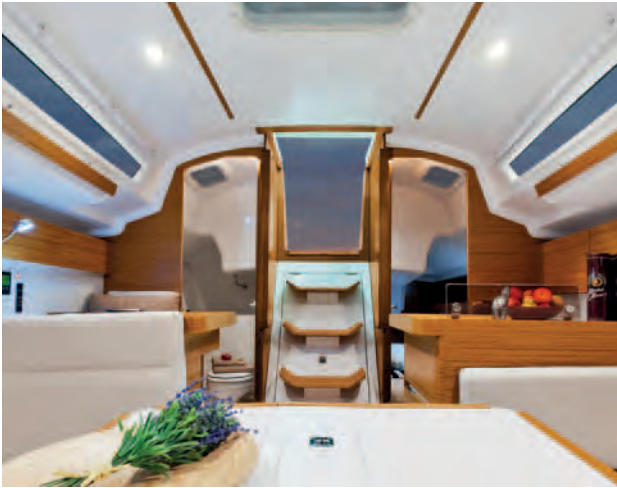
Elan E3 features a lower companionway for easier access down below, LED overhead lights and ergonomically positioned handrails.