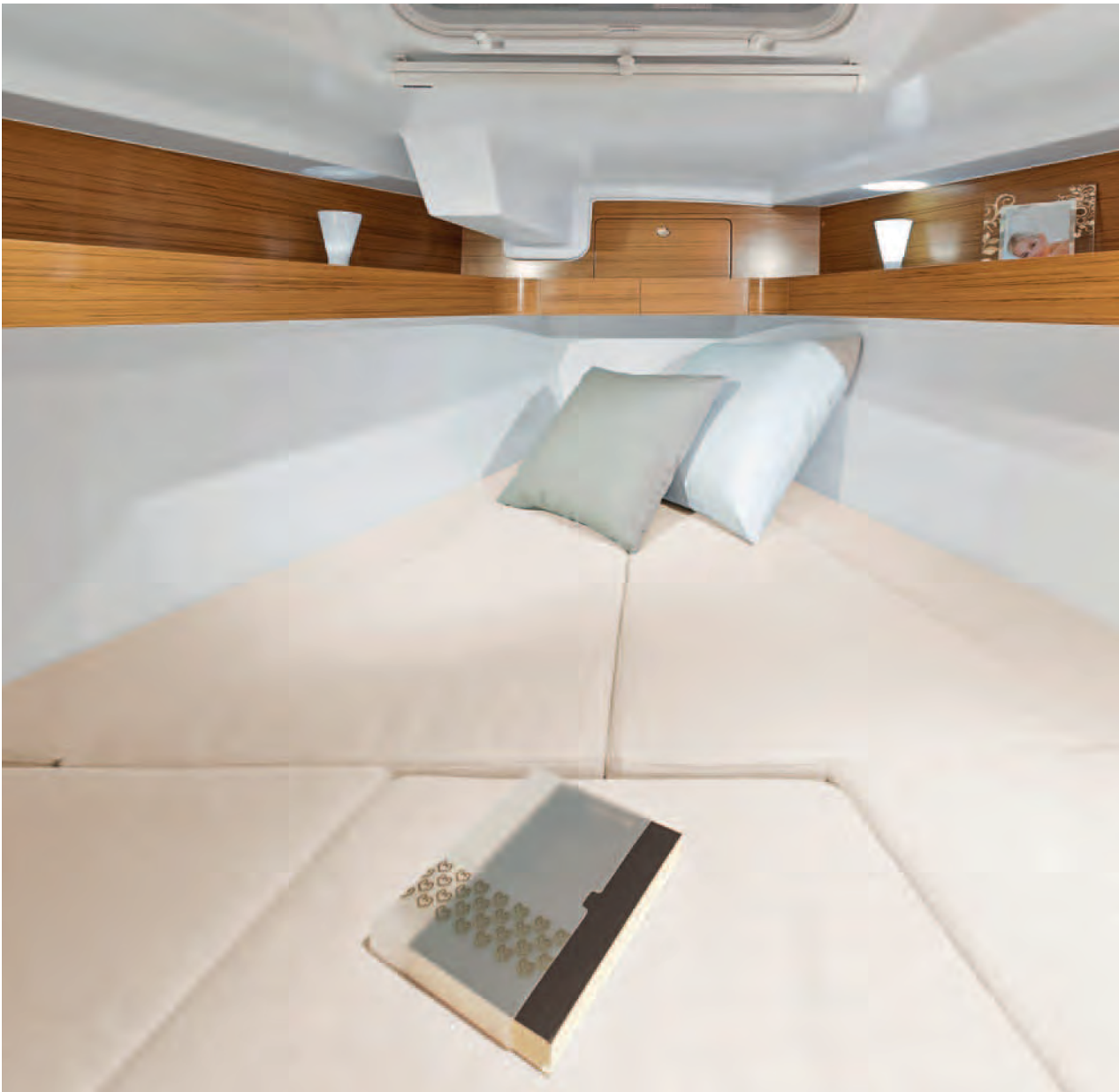
Plenty of storage space, extra wide cabin door and a comfortable double berth.