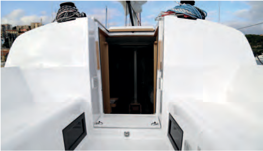
Lower companionway for easier access down below and more safety.