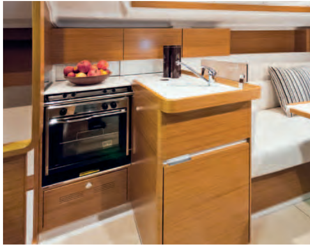
The L-shaped galley is well equipped and functional.