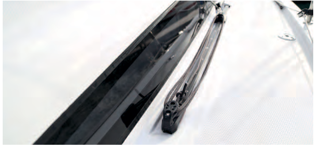
Genoa cars along the coachroof for optimum sheeting angle and safe passage forward.