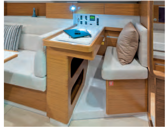
Ample space at the navstation, complete for all instruments.