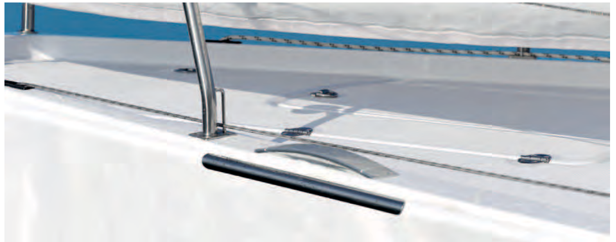
Retractable cleats for a clean deck and more efficiency (standard on S3).