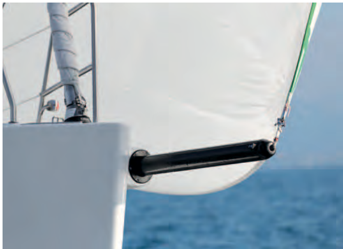
Retractable gennaker pole, optional in carbon for an enjoyable downwind sailing.