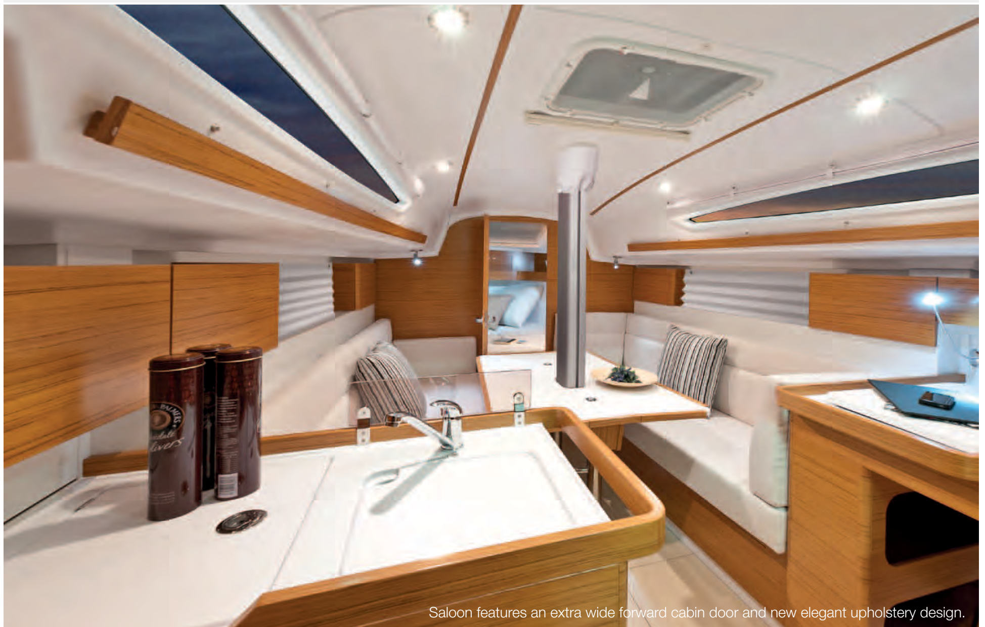
Saloon features an extra wide forward cabin door and new elegant upholstery design.

The pure joy of sailing does not have to stop whilst moored. Elan E3's bright and airy interior does not compromise when it comes to on-board comfort and cruising leisure. With a big, social saloon area with standing headroom, well equipped galley and comfortable cabins, the crew will enjoy every minute on this performance cruiser, especially as it will probably be among the first back on the mooring and secure the best space! But when racing calls again, the saloon, galley and cabin cabinets can be removed to save considerable weight (available as an option).