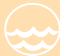
STRONG & STABLE THE 4x4 OF THE SEA

The HPC48 is a strong, stable power catamaran that has been dubbed the 4x4 of the sea