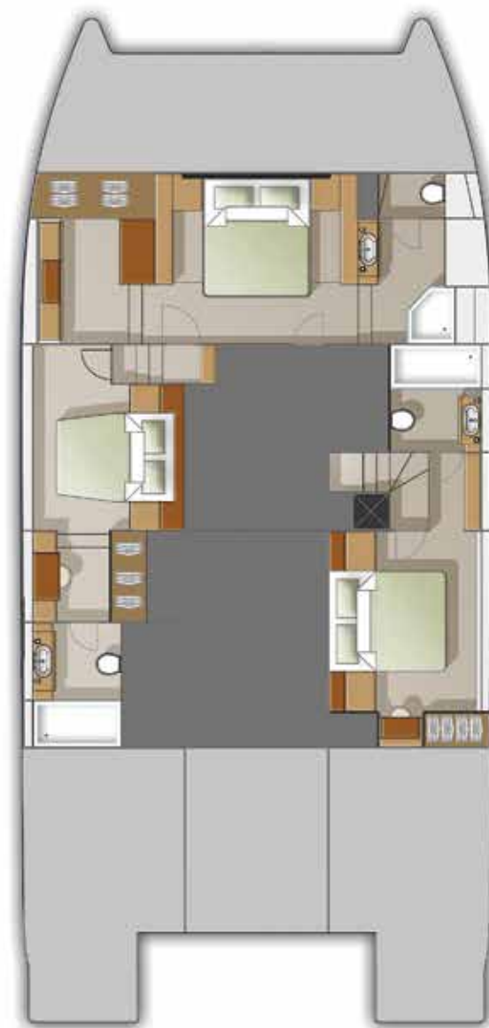
THREE CABIN OPTION