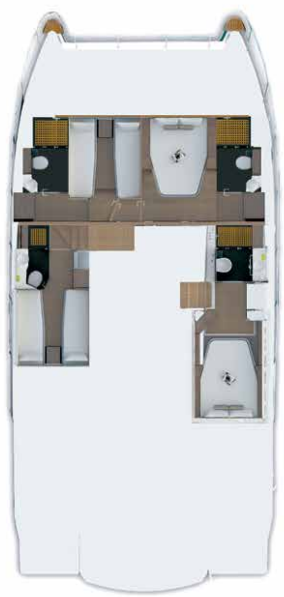
FOUR CABIN OPTION