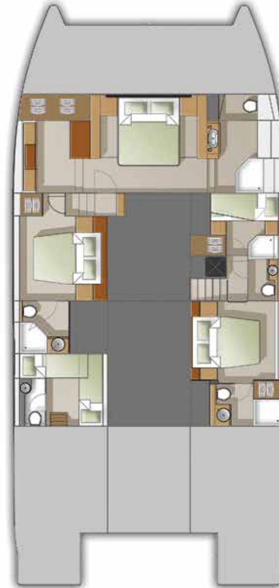
FOUR CABIN OPTION