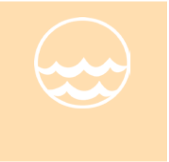
A LUXURY APARTMENT ON THE SEA

The enclosed flybridge allows you to create a fully air-conditioned wheelhouse with internal stairs linking it to the saloon