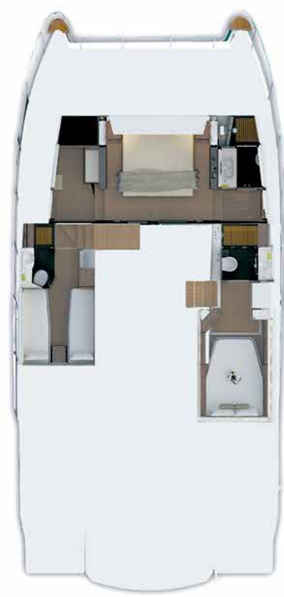
THREE CABIN OPTION