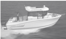
Merry Fisher 695 marlin