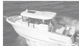
Merry Fisher 855 marlin