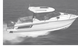
Merry Fisher 795