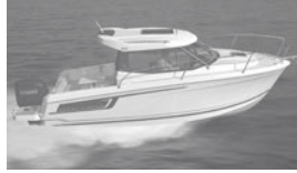
Merry Fisher 695