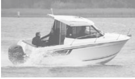
Merry Fisher 605