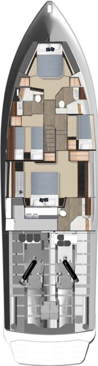
Optional crew design