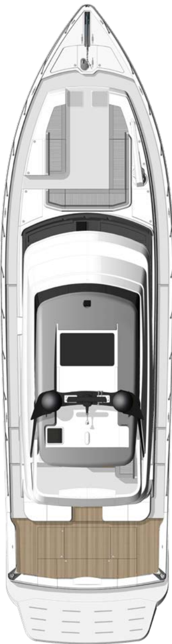
Optional teak cockpit floor