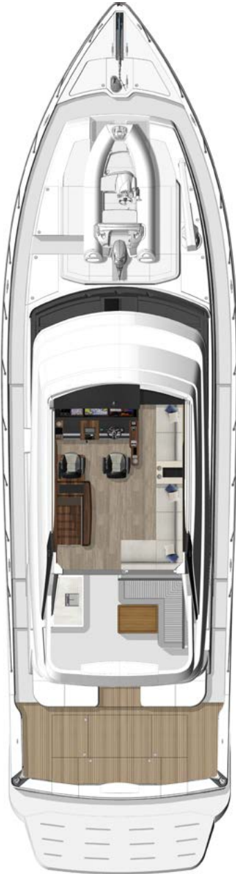
Optional tender and davit