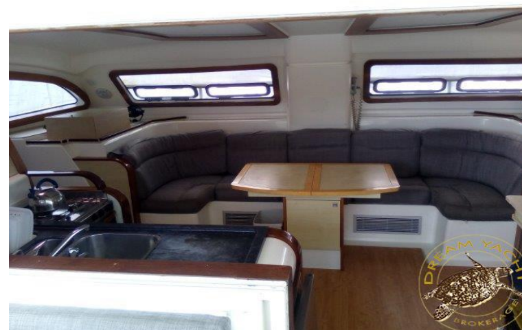
Catana 47 - 2012