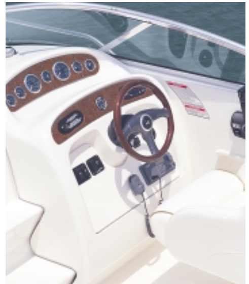
Full controls and instrumentation are at your fingertips, with illuminated switches and custom low-glare backlit gauges.

Sea Ray Boats, Inc., 2600 Sea Ray Blvd., Knoxville, TN 37914. For information call 1-800-SRBOATS or fax 1-314-213-7878. Note: Not all accessories shown in pictures or described herein are standard equipment or even available as options. Options and features are subject to change without notice. Not all model year boats may contain all the features or meet the specifications described herein. Confirm availability of all accessories and equipment with an authorized Sea Ray dealer prior to purchase. Printed in the U.S.A. June 1999 © Sea Ray Boats, Inc., MRP#1330992