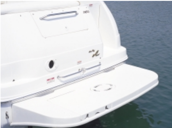
The additional swim platform has a stainless steel swim ladder concealed in the portside hatch.