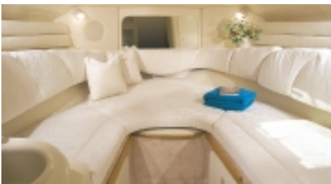
The versatile V-berth functions as a dinette by day and a comfortable sleeper by night.