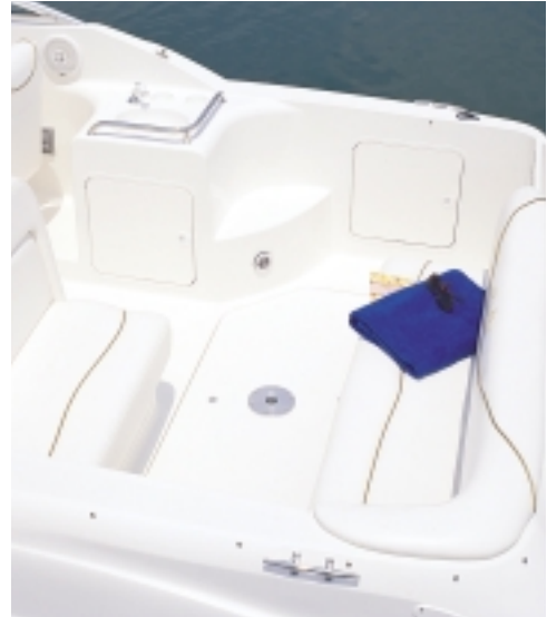
The large self-bailing cockpit is perfect for friendly gatherings. In the aft section, there's a refreshment center with wet bar and cooler, a port aft-facing seat with fold-down sun pad and a foldaway aft bench.