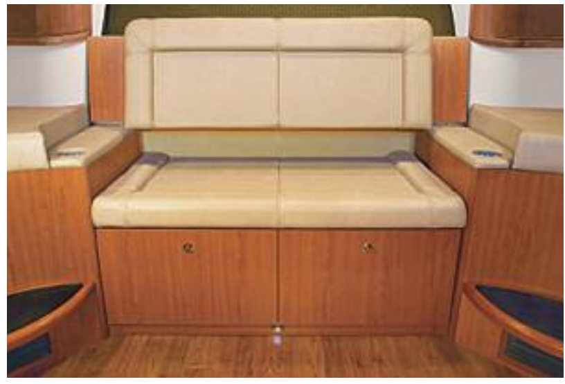
The queen centerline berth folds up to reveal a love seat that makes for a perfect spot to watch the standard flat panel LCD TV. Look closely – yes, those are cup holders that light with a soft blue LED when you remove your drink.

We asked boat owners what they wanted in a 37 foot open sportfish. We then took their observations and turned our design and engineering team loose. The results are clear – the Canyon Series features a host of unique features that you will not find on any other sportfish under 40 feet.