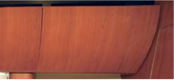
There is plenty of storage on this sportfish, and we designed the cabinetry to be uniquely stunning, featuring gently curved doors with secure, positive-locking hardware. You won't find joinery like this on another production boat!