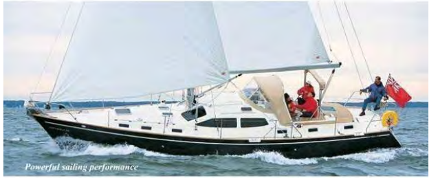
Southerly 135 sistership powerful sailing performance