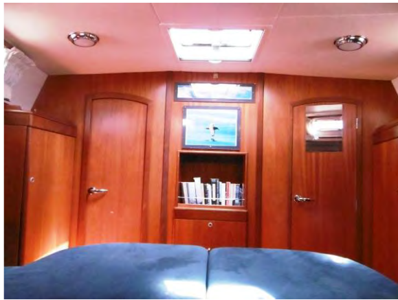
Master stateroom looking fwd