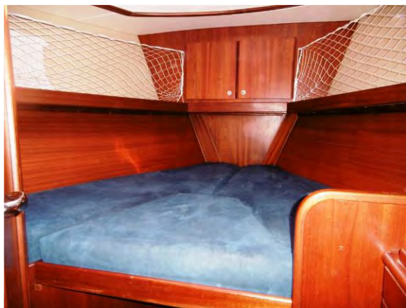
Guest stateroom fwd