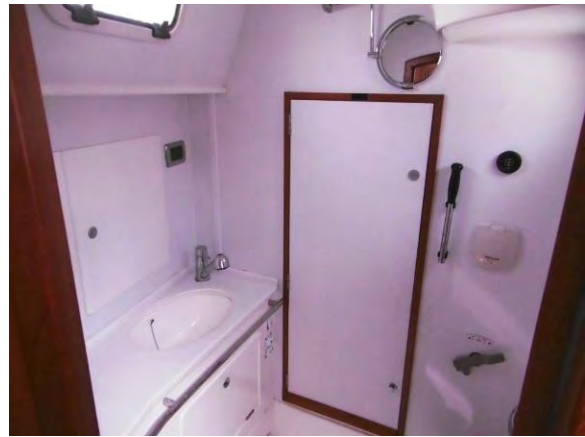
Master stateroom private ensuite head