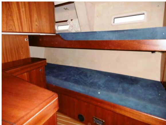
Southerly 135 third cabin