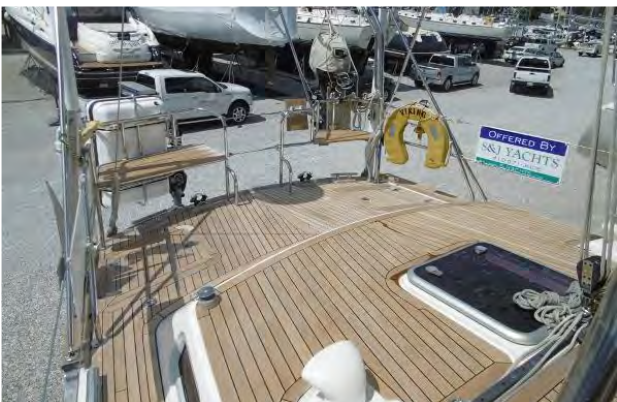
Plenty of room on the aft deck for sun bathing and lounging