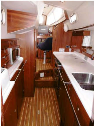
Galley looking fwd