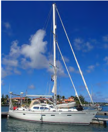
Southerly 135 Viking