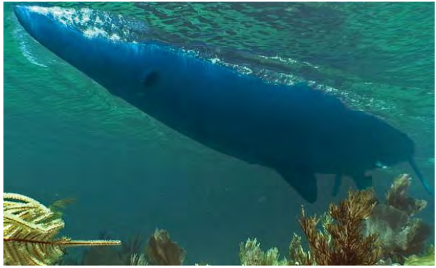
The Southernly keel partially lowered for cruising in shallow waters