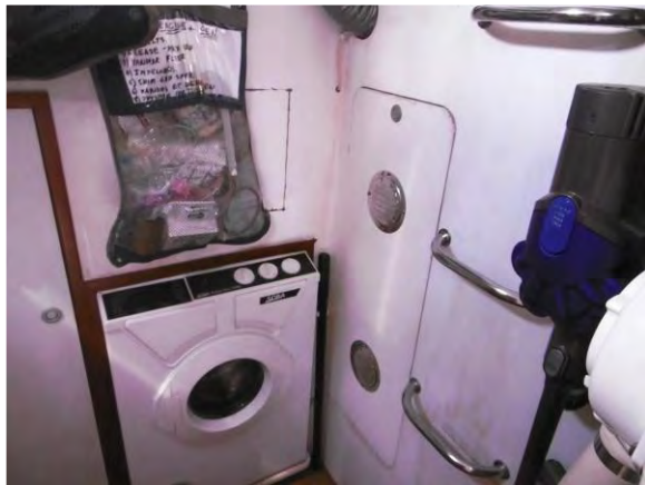
Washer in work room and access to engine