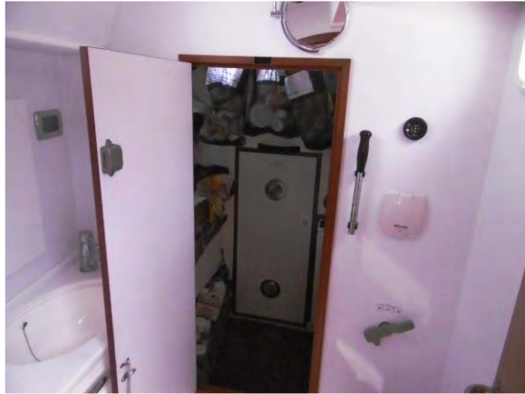
Access to work room from master head