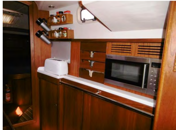
Galley storage and microwave inboard