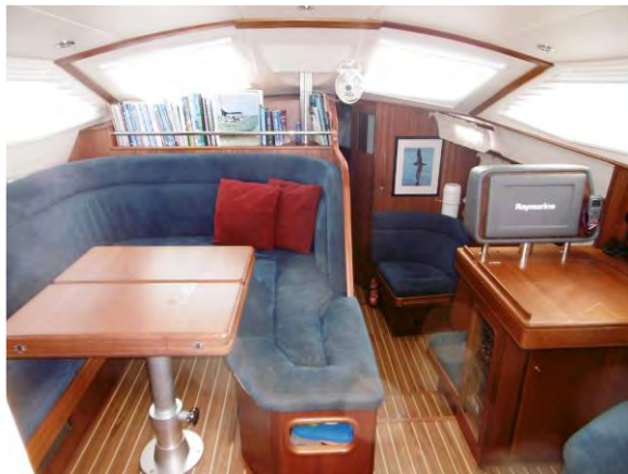
Southerly 135 interior