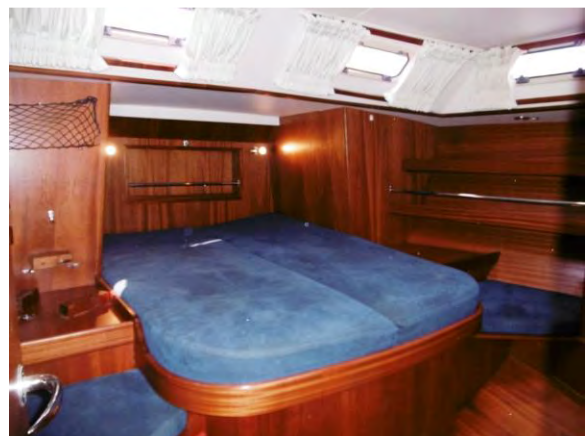
Large comfortable master stateroom