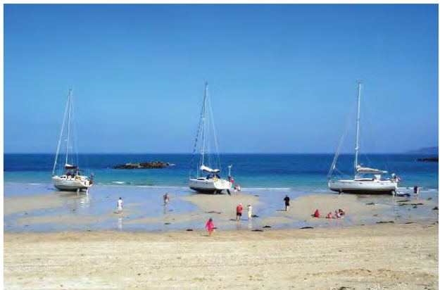
A Southernly beach party