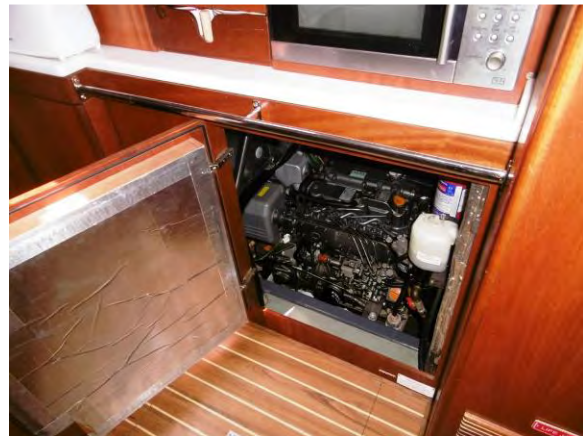
Additional access to engine from galley