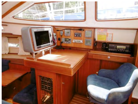
Raised nav station with all those windows allows you to see while underway