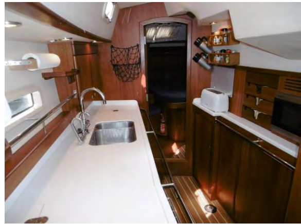
Spacious inline galley for added safety and comfort while underway