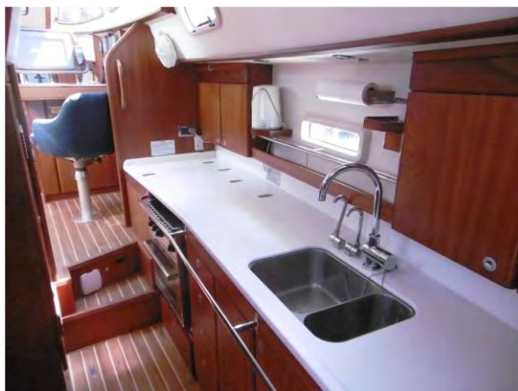
Galley has lots of counterspace and storage