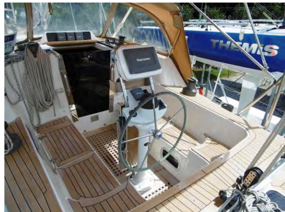
Safe cockpit with easy access and easy to single hand