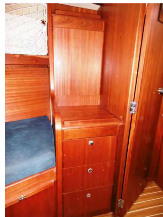
Guest stateroom storage