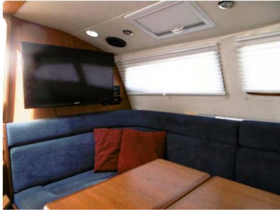
Flat screen TV in salon