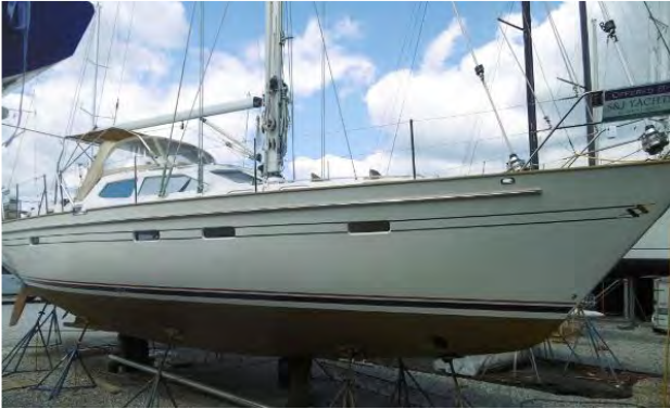
Southerly 135 with the keel raised