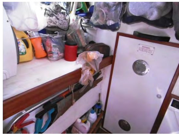
Work room has a work bench, storage and access to generator