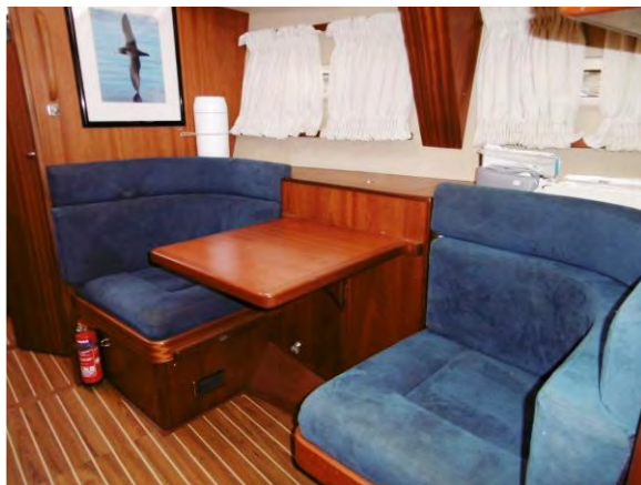
Separate seating alcove with windows is a great place to "get away"