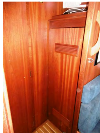
Hanging locker fwd of salon