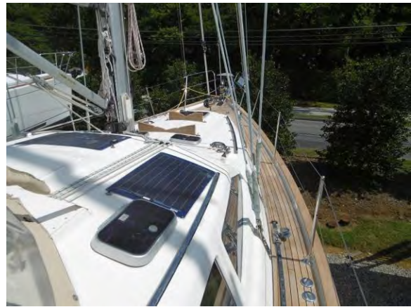
Solar panels on coach roof