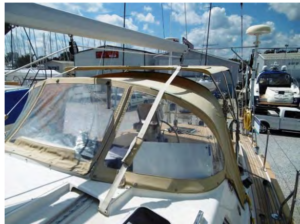
Dodger and bimini