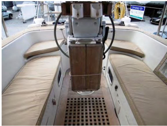
Cockpit cushions for added comfort