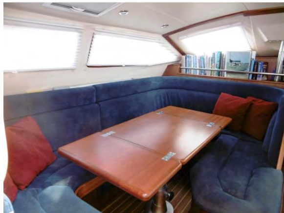
Raised salon seating with panoramic views