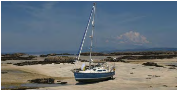
See what a Southernly will do when the water leaves you