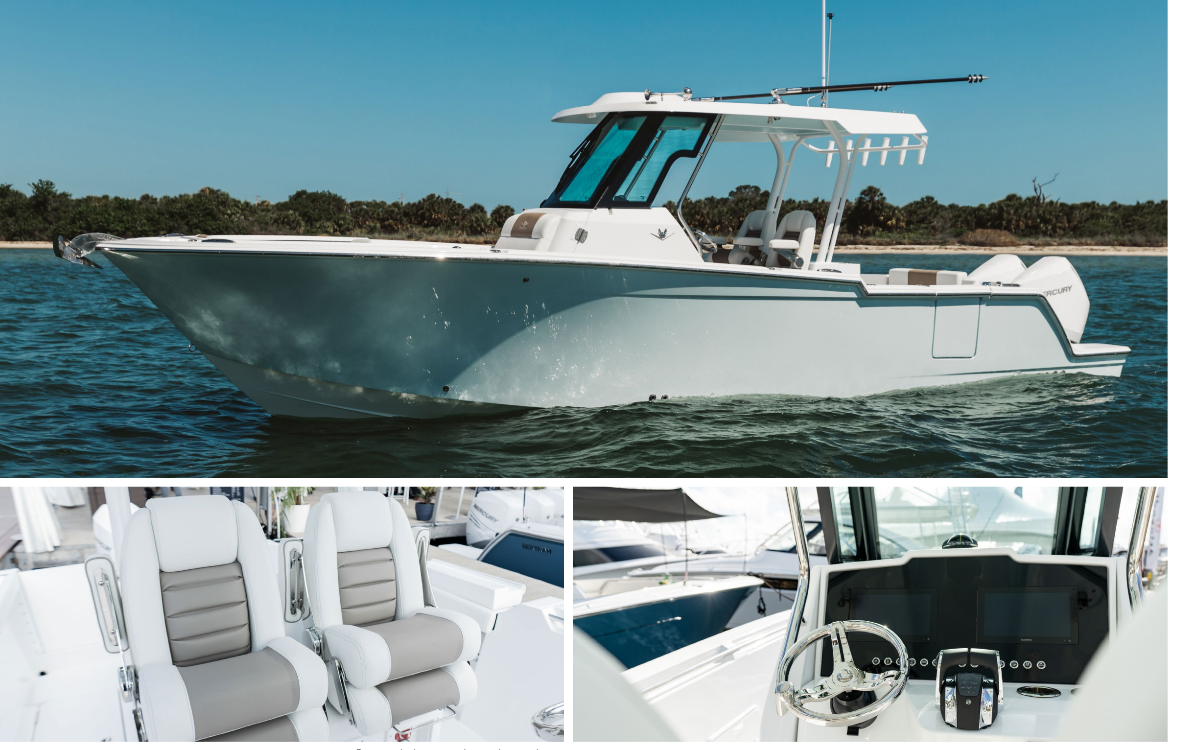
Dune upholstery package shown above.

Every aspect of the 28CC was designed with you in mind. Featuring all the essentials a fisherman needs and room to entertain up to 12 people, this boat is as comfortable chasing the sunset as it is chasing fish.