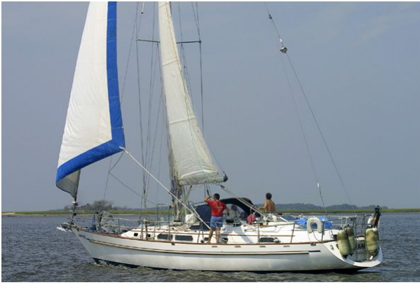
Tayana 52 CC

modern cabintrunk that does not stir the same passion although it does make for superior accommodations. Underneath, she features a long fin keel with separate skeg hung rudder. Above the main spar is surprisingly short at 61-feet.