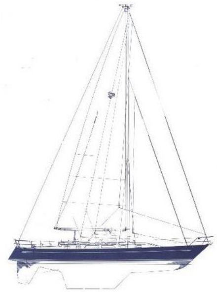
Tayana 52 Line Drawing

their yachts tougher than cobs, and the 52 is no exception. The hull is hand laid fiberglass cored with closed cell PVC foam while the deck is balsa cored. The mast is keel stepped. Many 52's especially those from the 1980's come with teak decking with all its mixed blessings. Comparing the joinery on Tayana yachts over the years, the amount of teak down below has understandably decreased over the years. While 52's from the 1980's and early 1990's have solid teak staving a-plenty, the most recent models have mostly teak veneer. In an ever more environmentally conscious world I think this is a good thing.