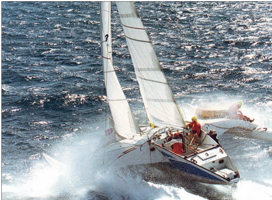
One of the original 36' (10.9m) racer-cruisers built to Newick's Echo model, shown racing in the New Zealand Coastal Classic. According to their designer, several of these boats were owner-built in that country; one, professionally built. Newick's comment on this photo: "We like to sail to windward. In warm weather."

you know it, the whole boat is 10% heavier—and not a success."