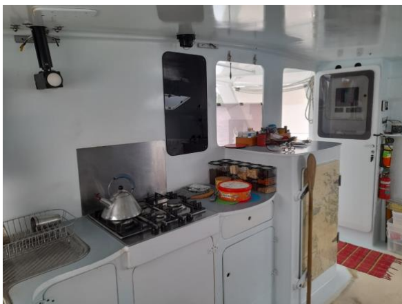
The four burner Bosch cooktop and the custom built fridge

Plenty of storage space under the sofas.