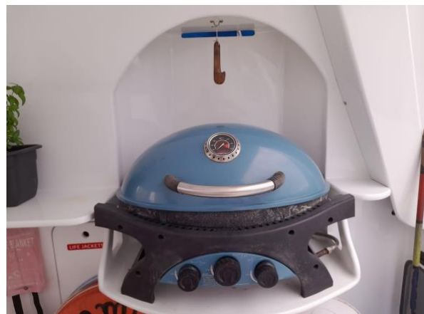
The three-burner Ziegler and Brown barbecue