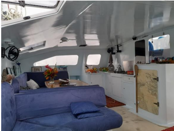
Chemistry living space and galley, with dining table, sofa, stereo and smart tv.