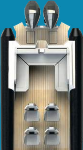
4 seats and U-Shape bench