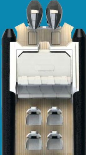
4 seats and sunbed for stern