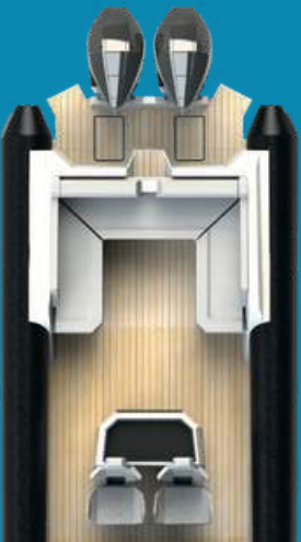
2 seats, wetbar and U-Shape bench