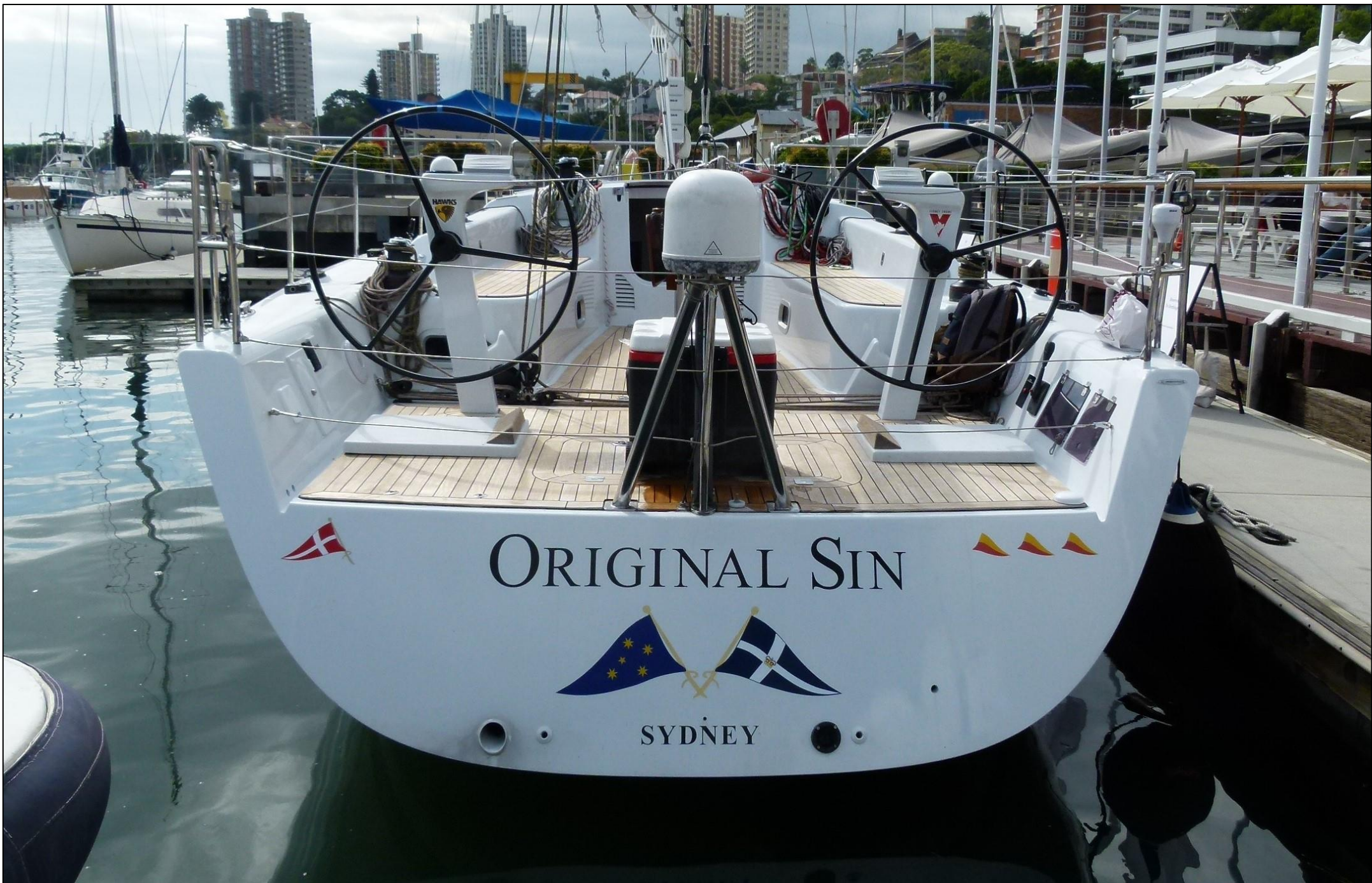
Original Sin's teak cockpit, carbon steering wheels, satellite communications, electric winches and of course the all-important esky. The burgees are for the Middle Harbour Yacht Club, the Cruising Yacht Club of Australia, and the Royal Brighton Yacht Club. The three naval numerals represent our sail number 777.