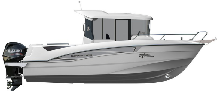
3 door version: