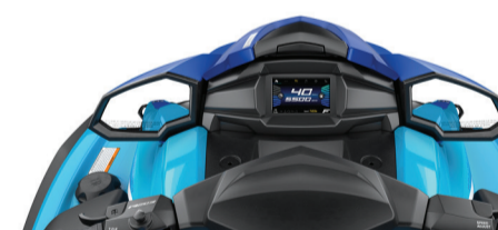
4.3" CONNEX SCREEN