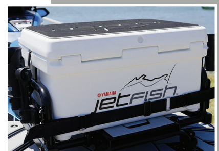
PREMIUM FISHING KIT