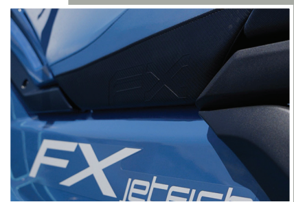
FX JETFISH DECALS