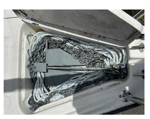
Anchor with new anchor rope