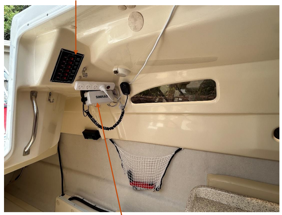
Simrad RS12 VHF radio