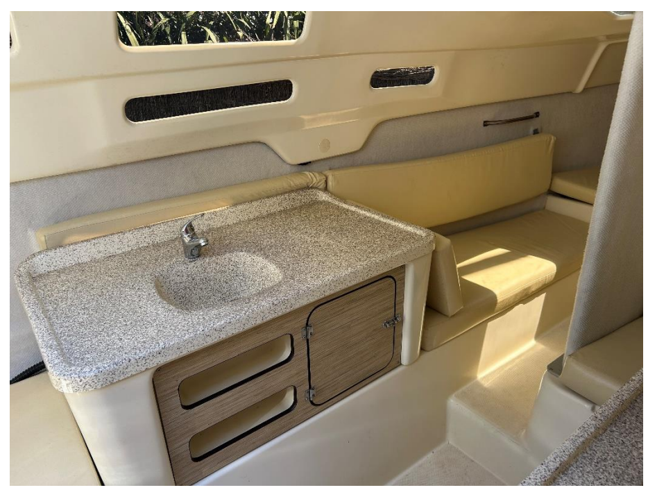
Galley unit with sink, tap & cupboard on port side (1.1 x 0.65m FRP benchtop)

Table (1 x 0.8m) with central storage tub on starboard side