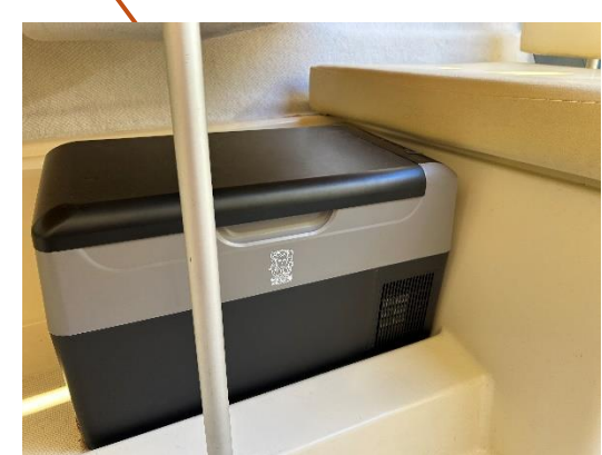
12V portable fridge freezer (22l) Portable Gasmate 1 burner stove