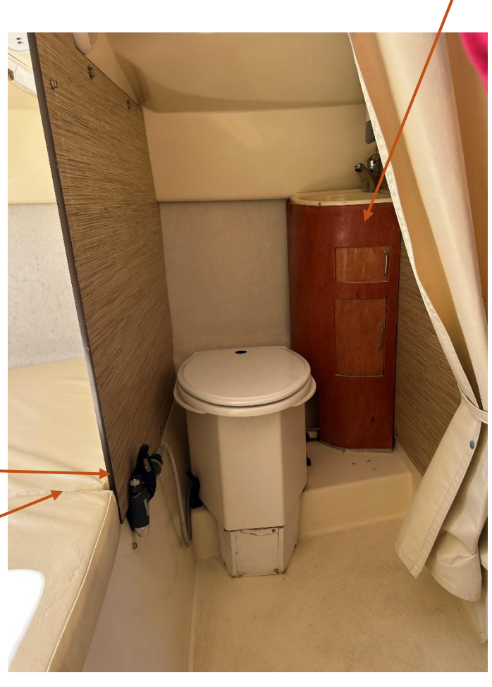
Head / Toilet (0.7m wide cubicle) (composting + fluid direct discharge)