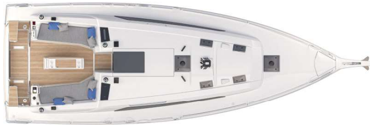
Standard version: 2 cabins + 1 head