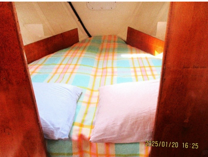
ALTERNATIVES – TWIN BERTHS OR A DOUBLE BED