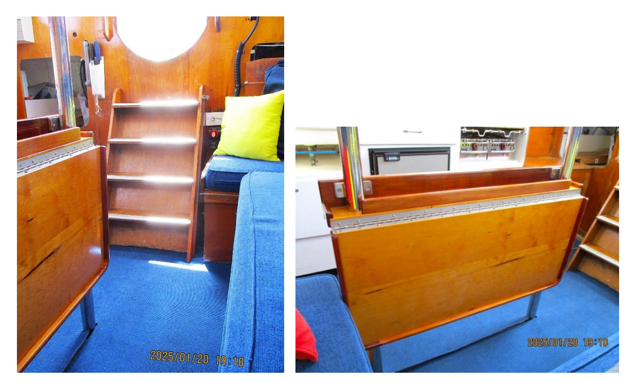
COMPANIONWAY AND DINING TABLE - FOLDED.