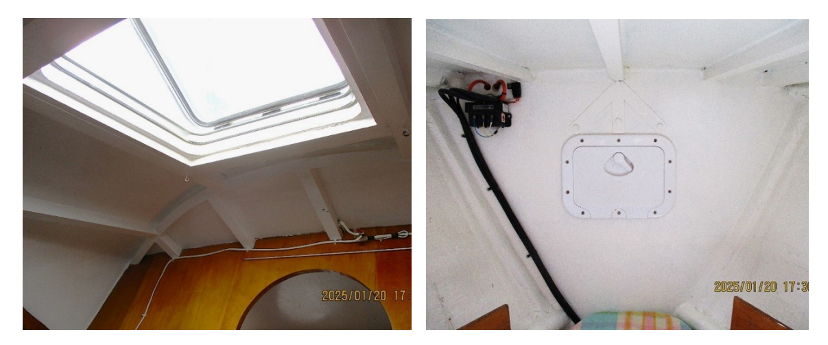
FOREHATCH AND FORWARD BULKHEAD