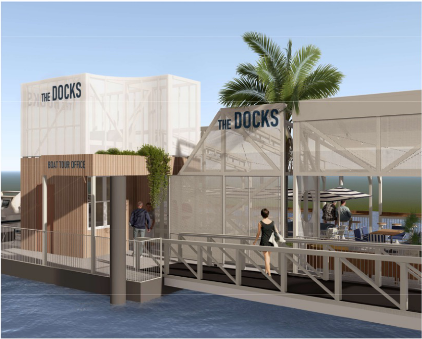
EXTERIOR PONTOON ENTRY