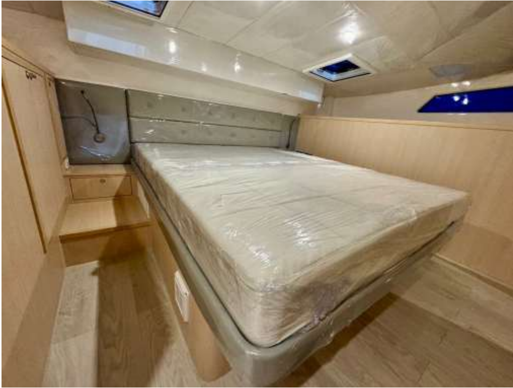
PP42 Master cabin king bed