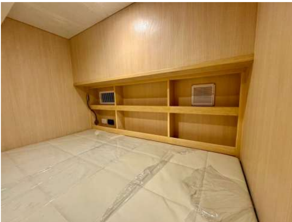
Aft Bedroom Queen