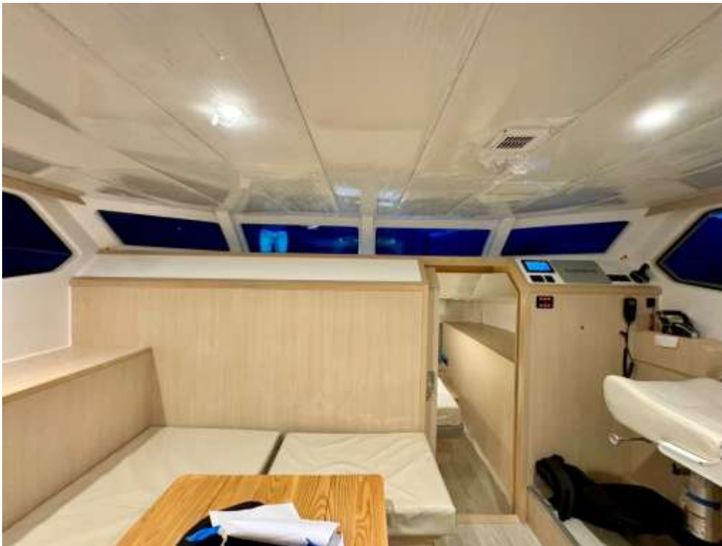
PP42 salon looking Fwd